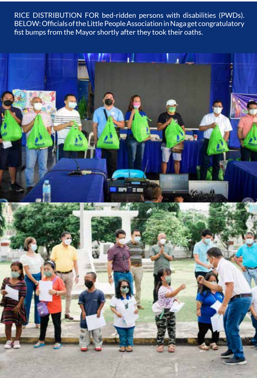
RICE DISTRIBUTION FOR bed-ridden persons with disabilities (PWDs). BELOW: Officials of the Little People Association in Naga get congratulatory fist bumps from the Mayor shortly after they took their oaths.

2021-145 Ratifying the MOA between the Naga City Government and Ocean Bound Plastic-Recycling Philippines, Inc. regarding the proposed Naga City-Wide Plastic Bank Ecosystem Project . 2021-022 Ratifying the MOA between the Naga City Government and the DENR-Mines and Geosciences Bureau-Region V, regarding the Conduct of Geohazard Identification Survey of Mabolo Homes Subdivision, a Socialized Housing Project in Bgy. Mabolo, Naga City 2021-119 Ratifying the MOA between the Naga City Government and the Philippine Statistics Authority (PSA) for the roll-out of the Philippine National Identification System (PHILSYS) Registration in the City of Naga. 💎