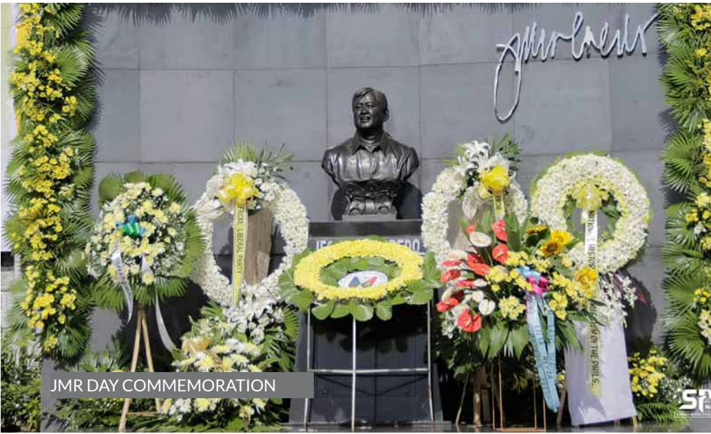
JMR DAY COMMEMORATION