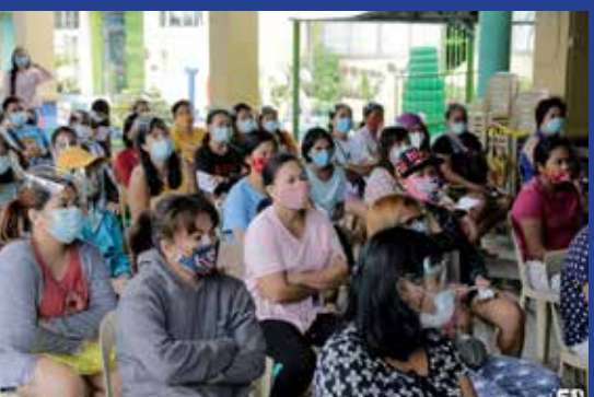
MEASURES FOR YOUTH AND OTHER SECTORS