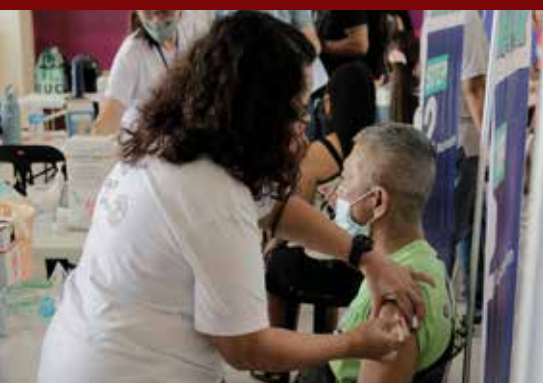
SALBAR BUHAY/SALUD: ANTI-COVID MEASURES