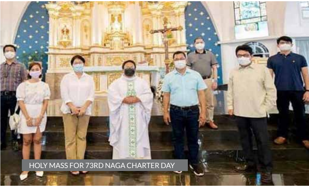
HOLY MASS FOR 73RD NAGA CHARTER DAY