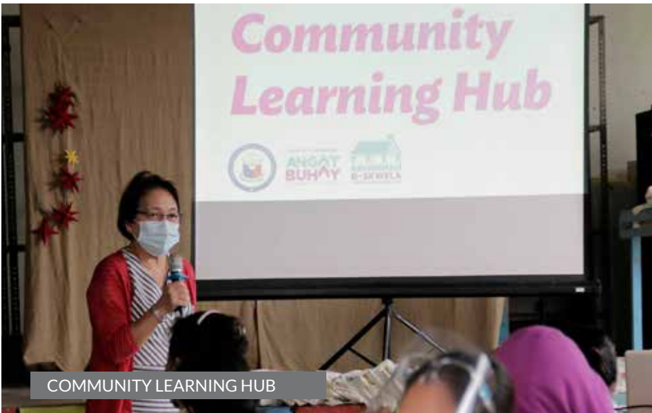
COMMUNITY LEARNING HUB

TEAM ROBREDO-PANGILINAN PROCLAMATION MOTORCADE. Members of the Sangguniang Panlungsod and fellow supporters pose for posterity at the start of a nationwide People's Proclamation Motorcade for the tandem of VP Leni Robredo and Kiko Pangilinan .