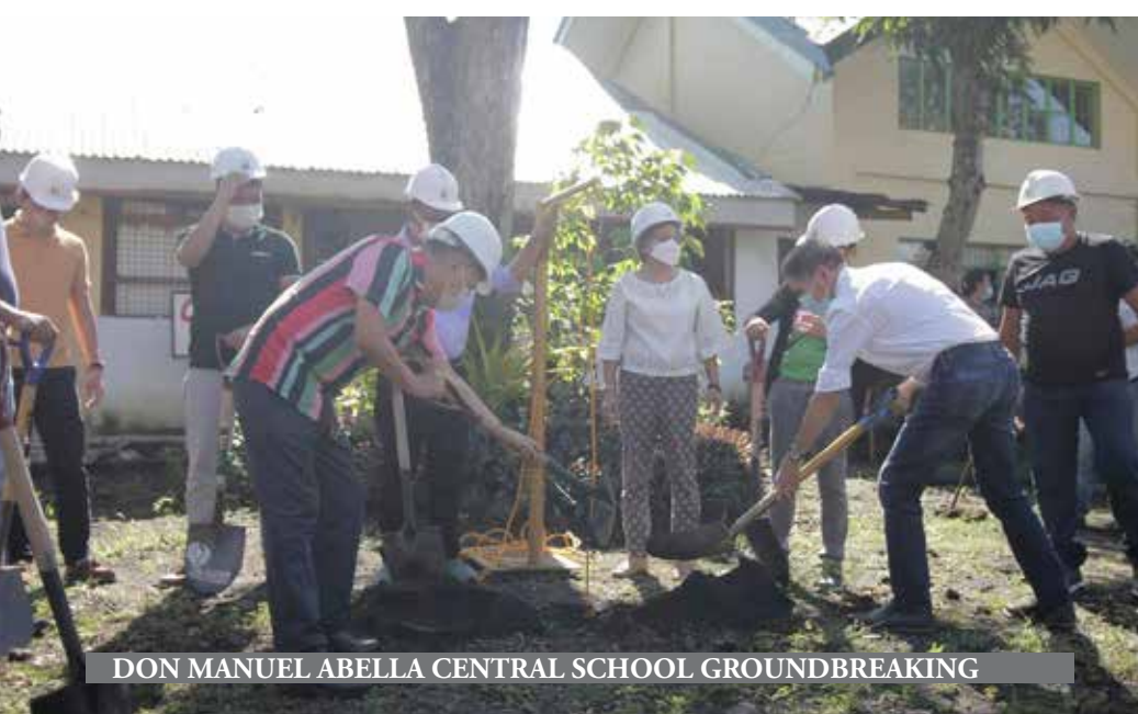
DON MANUEL ABELLA CENTRAL SCHOOL GROUND BREAKING