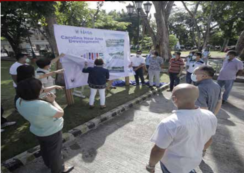
HOUSING PROGRAM FOR EMPLOYEES, URBAN POOR. Officials present artist's perspectives showing the Carolina New Area Development for employees and teachers. Mayor Nelson Legacion and VM Nene de Asis led the unveiling witnessed by members of the council and City Hall employees. Other similar projects are the Liberty Village in Bgy. Carayayan and the St. Isidore Village in Bgy. San Isidro.

Further, the mayor's development priorities and thrusts, which are translated into city development plans by the city development council, can only be funded and implemented upon approval of the Sangguniang Panlungsod. jbp ❖