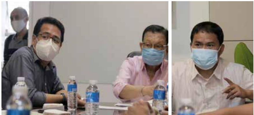
GAMES AND AMUSEMENT. Hon. Sonny Rañola chairs the hearing on a request for a resolution interposing no objection for a company to operate a gaming site, and another for seeking for a permit to hold offline sabong at a sports bar. Councilors Greg Abonal, co-chair, Elmer Baldemoro, and Dodit Beltran are also joined by other members of the committee.