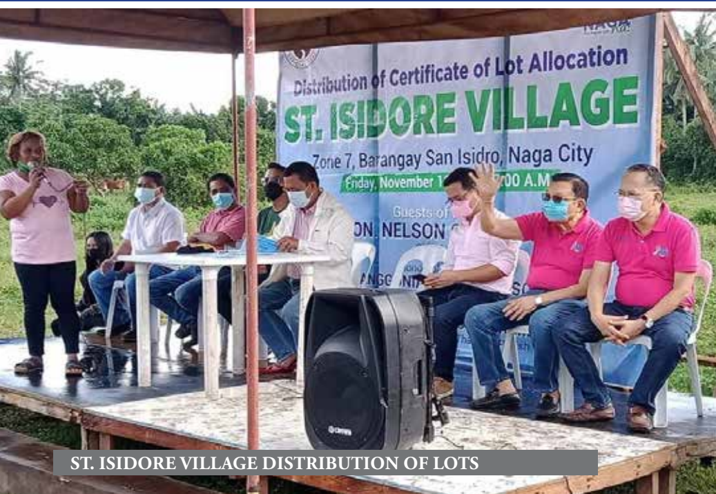
ST. ISIDORE VILLAGE DISTRIBUTION OF LOTS