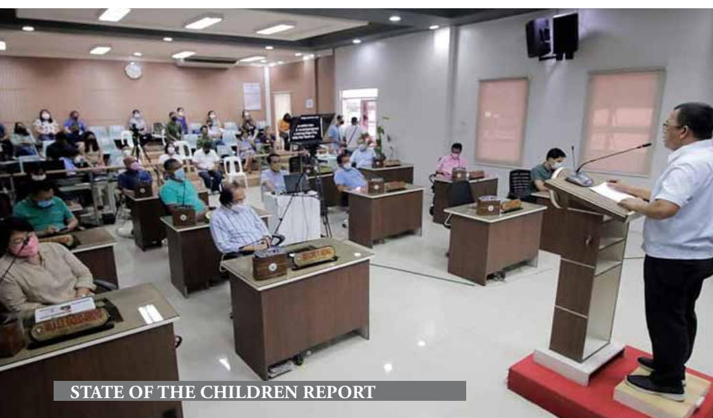
STATE OF THE CHILDREN REPORT