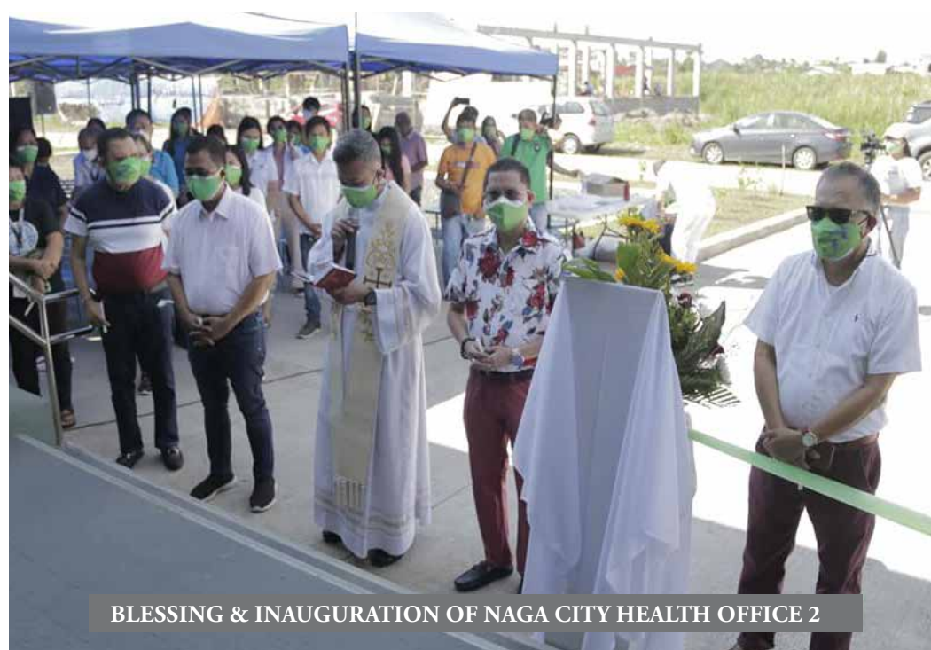
BLESSING &amp; INAUGURATION OF NAGA CITY HEALTH OFFICE 2