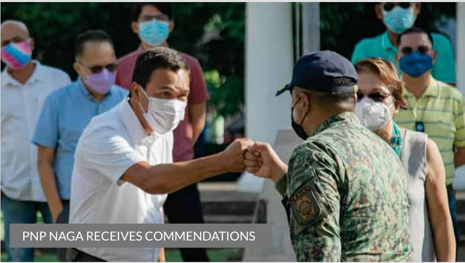
PNP NAGA RECEIVES COMMENDATIONS