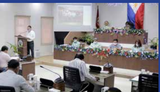
AN SAINDONG CONSEJO, COMMITTEE HEARINGS