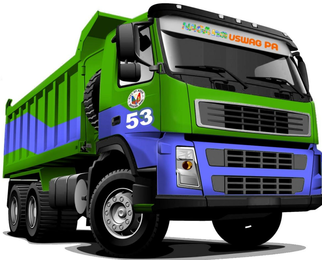
Sample Color Design