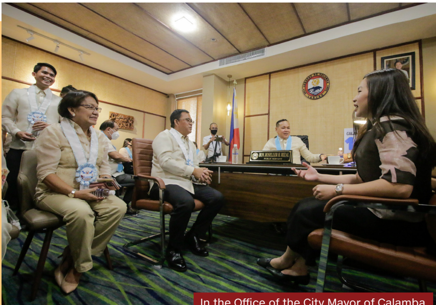
In the Office of the City Mayor of Calamba.