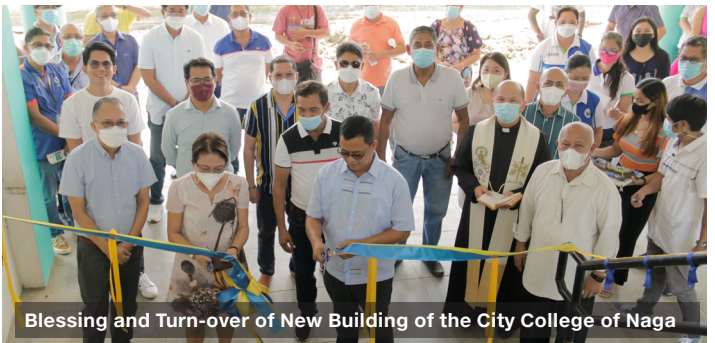
Blessing and Turn-over of New Building of the City College of Naga