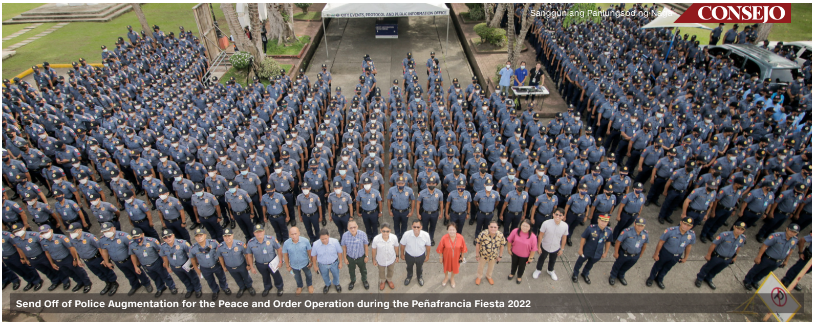
Send Off of Police Augmentation for the Peace and Order Operation during the Peñafrancia Fiesta 2022