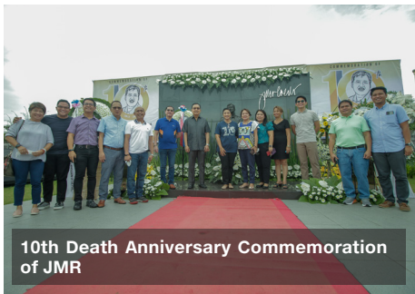
10th Death Anniversary Commemoration of JMR