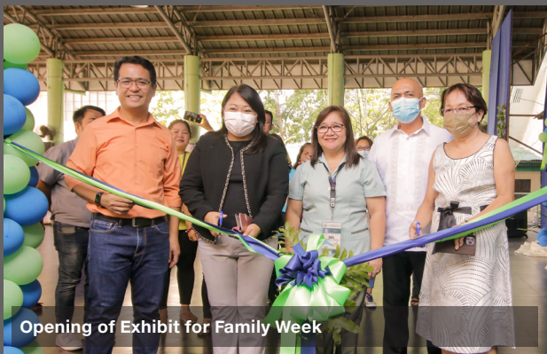
Opening of Exhibit for Family Week