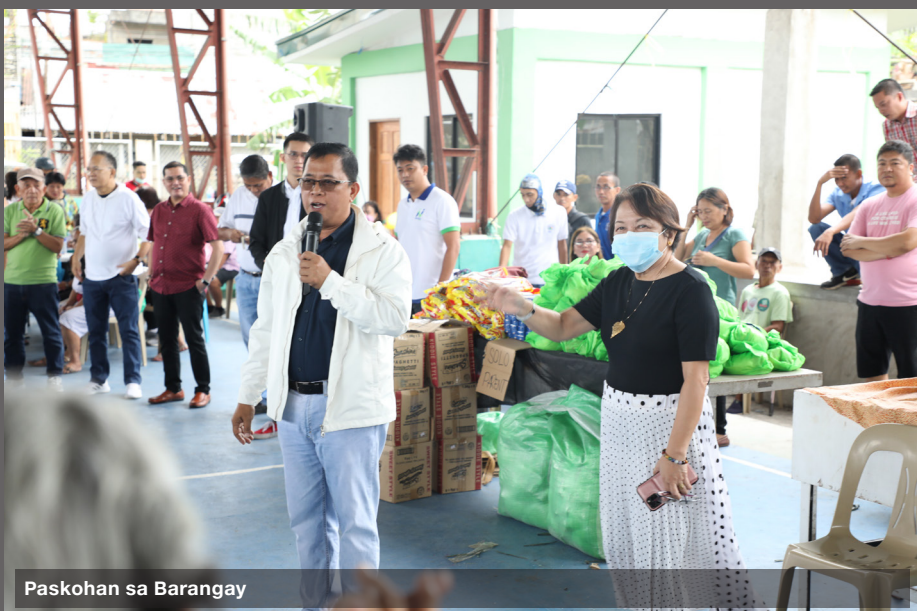
Paskohan sa Barangay