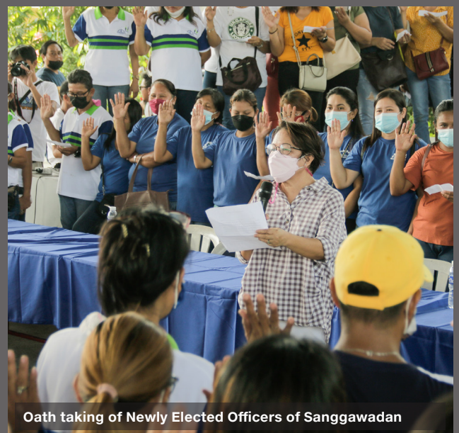
Oath taking of Newly Elected Officers of Sanggawadan