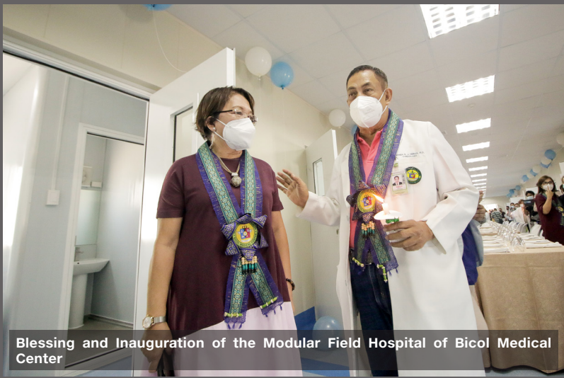
Blessing and Inauguration of the Modular Field Hospital of Bicol Medical Center