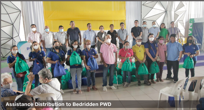
Assistance Distribution to Bedridden PWD