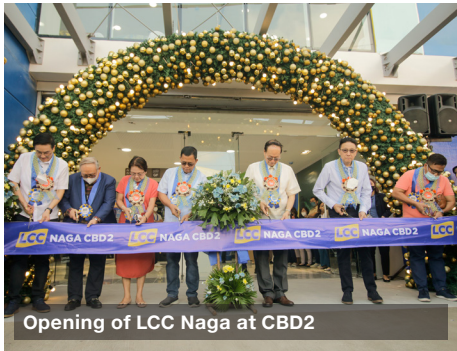
Opening of LCC Naga at CBD2