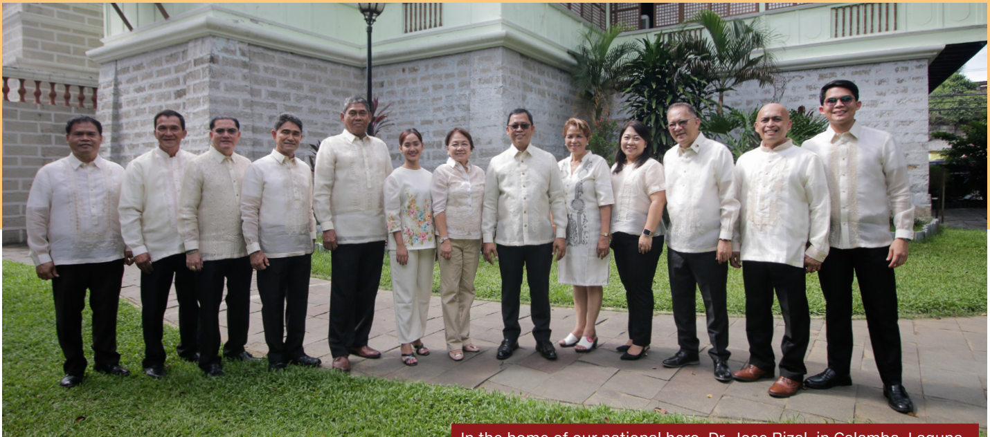
In the home of our national hero, Dr. Jose Rizal, in Calamba, Laguna.