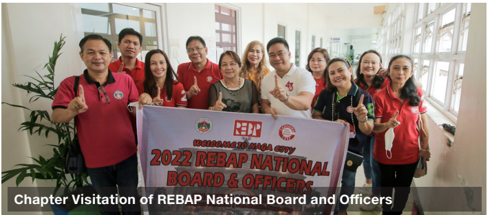
Chapter Visitation of REBAP National Board and Officers