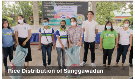
Rice Distribution of Sanggawadan