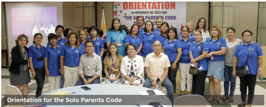
Orientation for the Solo Parents Code