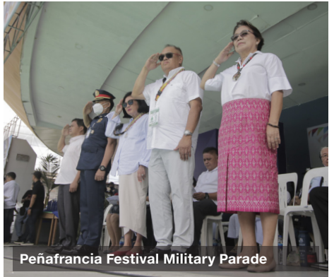
Peñafrancia Festival Military Parade