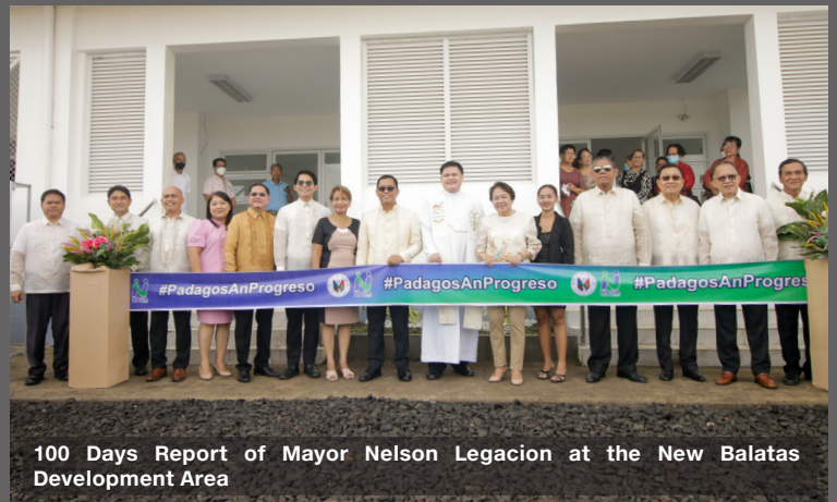
100 Days Report of Mayor Nelson Legacion at the New Balatas Development Area