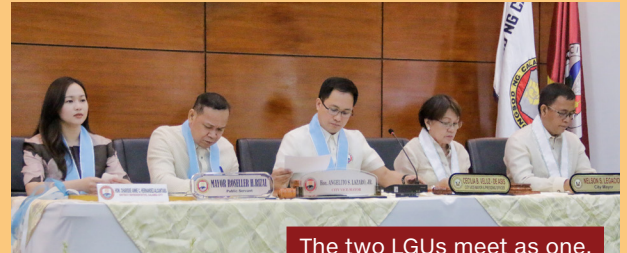
The two LGUs meet as one.