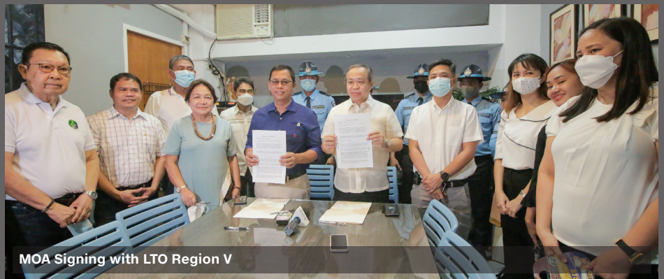
MOA Signing with LTO Region V