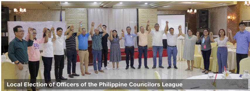
Local Election of Officers of the Philippine Councilors League