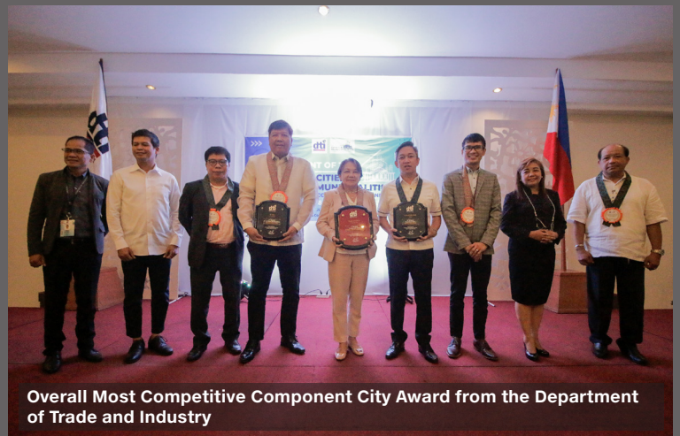
Overall Most Competitive Component City Award from the Department of Trade and Industry